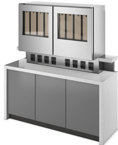
Shown with example cabinet.