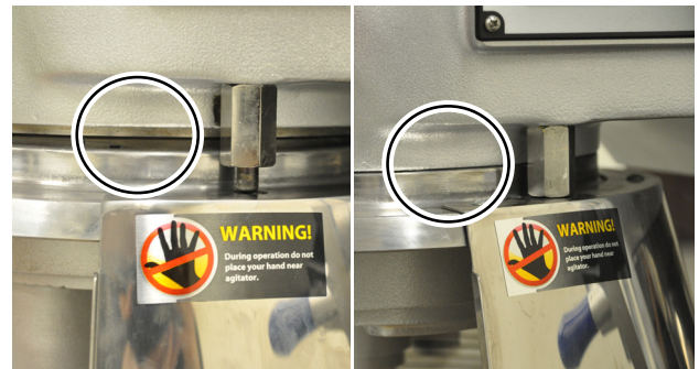
Gap - Incorrect