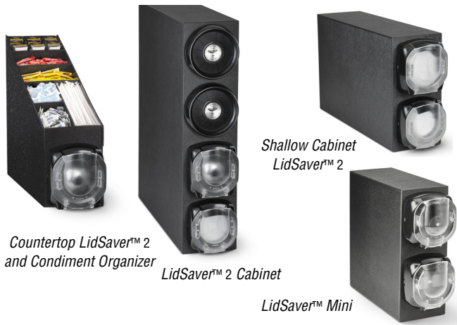
Countertop LidSaver™ 2 and Condiment Organizer