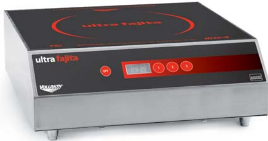
Ultra Induction Fajita Skillet Heater