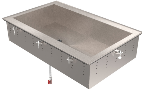
Drop-in: Non-Refrigerated Cold Pan