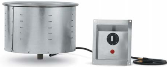
Modular Drop-In: Soup Well