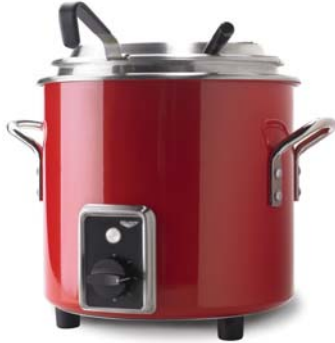
Retro Stock Pot Kettle Rethermalizer