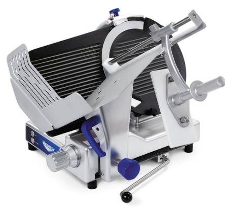
Heavy-Duty Deli Electric Slicer