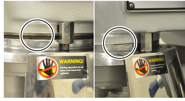
Gap - Incorrect